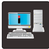
Install REDiSAFE Client on your workstation