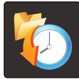
Select folders and schedule backup